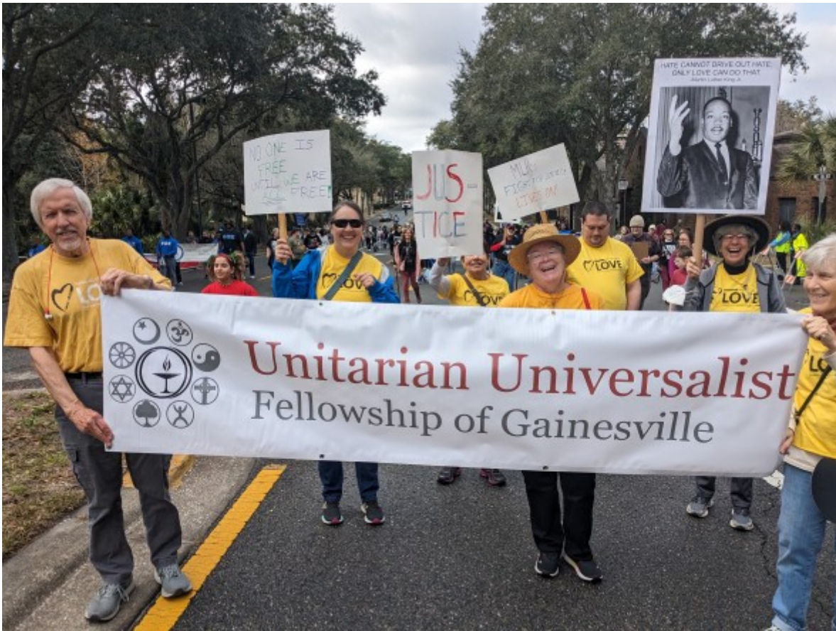
UUFG MEMBERS MARCHING IN THE MLK PARADE ~ JANUARY 15